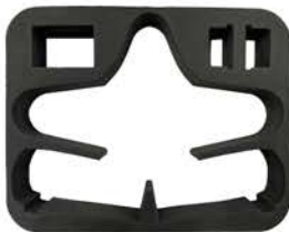
AYO HC EVA case foam insert