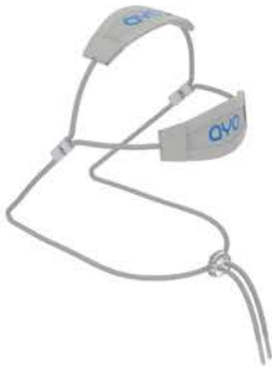
AYO Head Strap Assembly