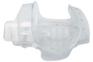
AYO Mask Bridge Assembly