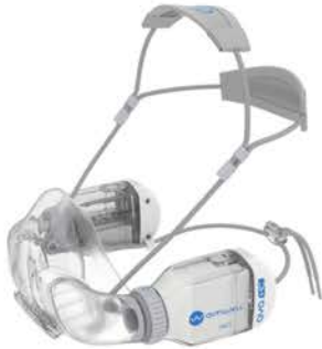
Healthcare Reusable Respirator