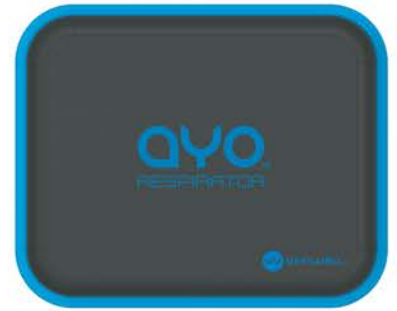
AYO EVA Case