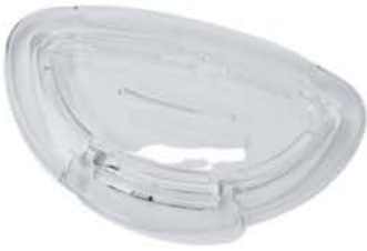
AYO Mask Speech Diaphragm Cover