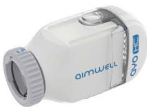
HCi Module - excluding filter