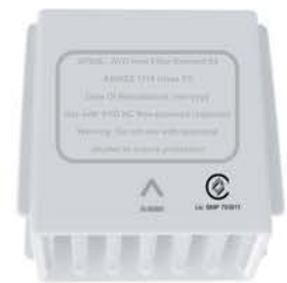
Inlet Filter Element 95 - Pack of 3