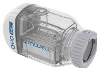
HCo Module - excluding filter