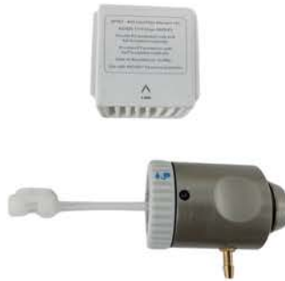
Fit Testing Kit